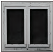
2 Lid Standard Density 10.83" W x 20.8" H