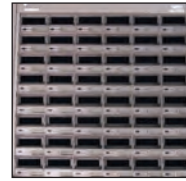
48 Lid** Max Density 3.65" x 1.12" x 1.01"