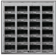
24 Lid High Density 4.96" W x 2.21" H