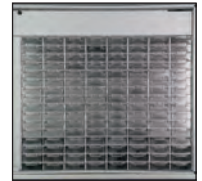
128 Compartments** High Density SBD II 2.36" x 4.48" x 0.88"

**due to the "U" shape design of the max density cover, the useable space is .78" x 1.01"