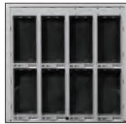
8 Lid Standard Density 4.96" W x 9.50" H