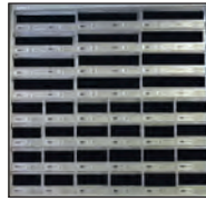
36 Lid** Max Density 24: 3.65" x 1.12" x 1.01" 12: 7.48" x 1.12" x 1.01"