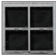
4 Lid Standard Density 10.83" W x 9.50" H