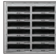
12 Lid Standard Density 10.8" W x 2.21" H