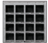
16 Lid High Density 4.96" W x 4.02" H