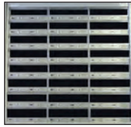
24 Long Lid** Max Density 7.48" x 1.12" x 1.01"