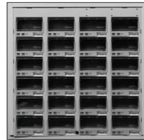
24 Lid High Density 4.96" W x 2.21" H Est. lbs. per Secure Bin: 4.16 Max lbs. per drawer: 100